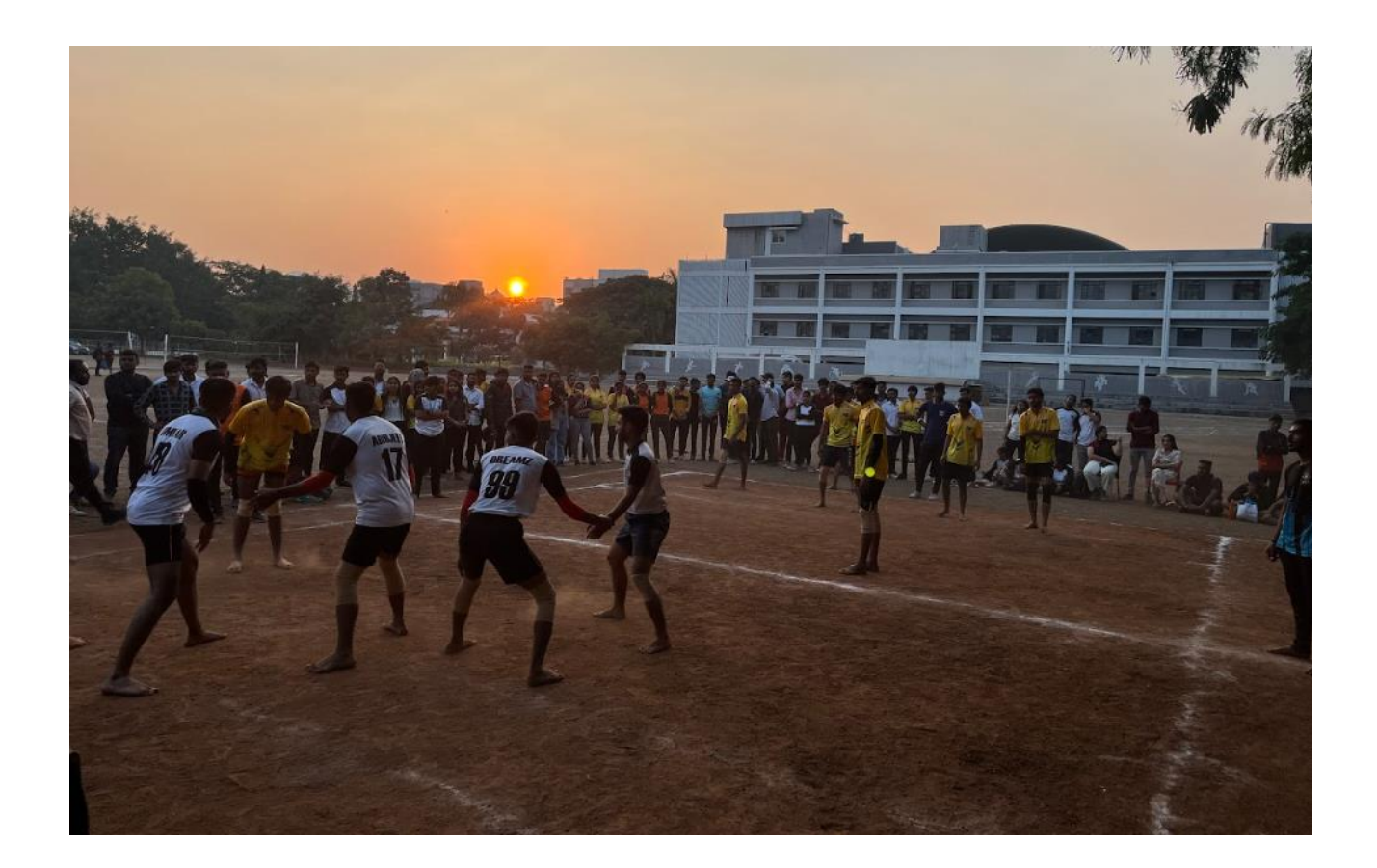
<u>Program</u> Department of Sports